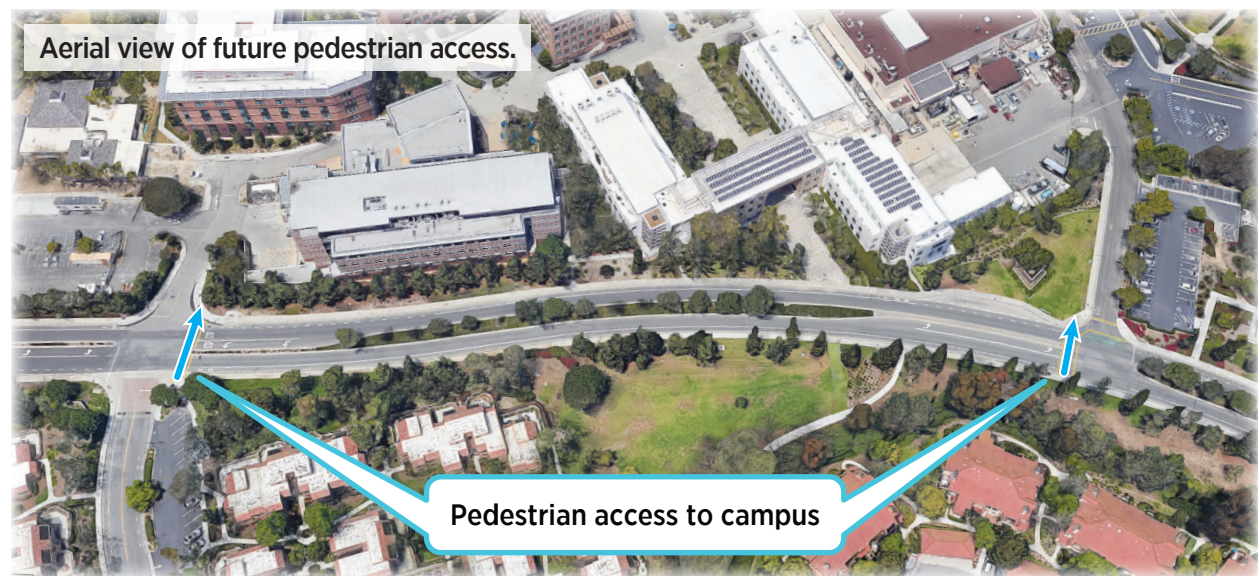
Aerial view of future pedestrian access.